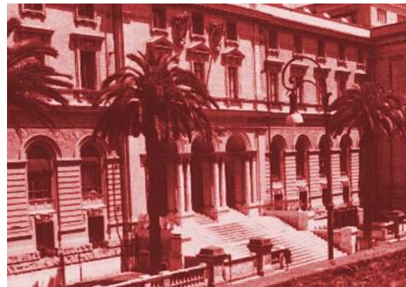
Rome, Faculty of Engineering, Venue of the Course

The Course aims at giving a complete knowledge of the basic physical mechanisms involved, of the various suitable design techniques, and of the possible antenna applications of Leaky Waves and Periodic Structures.