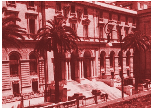
Rome, Faculty of Engineering, Venue of the Course

The Course aims at giving a complete knowledge of the basic physical mechanisms involved, of the various suitable design techniques, and of the possible antenna applications of Leaky Waves and Periodic Structures.