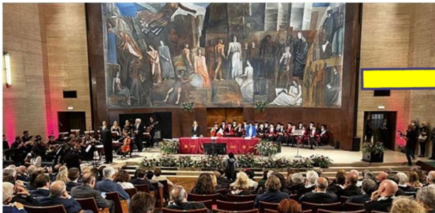
Inaugurazione dell'anno accademico 2023-2024

FACOLTÀ STRUTTURE DIDATTICA RICERCA INTERNAZIONALE NOTIZIE EVENTI TERZA MISSIONE